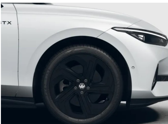
OPTIONAL ON ID.7 GTX PLUS (PJ3) 20" "Skagen" alloy wheels - Black Finish. Airstop Tyres 8.5 J x 20 front, 9.5 J x 20 rear, in black, high-sheen surface, Airstop Tyres