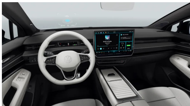
Mistral / Soul Black / Grey Detail / Shite Steering Wheel (AK) Optional from ID.7 PRO PLUS / PRO S PLUS (forces option package PBF)