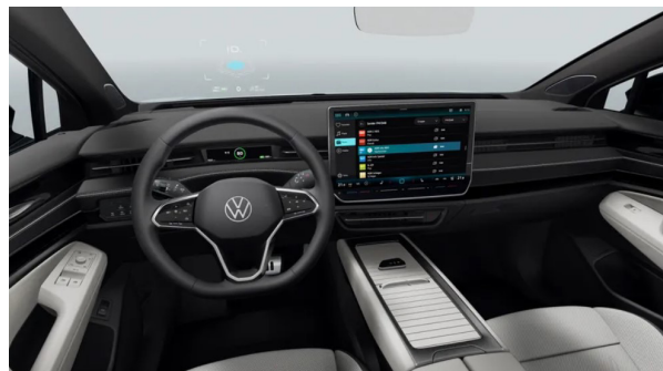
Mistral / Soul Black (ZP) Optional from ID.7 PRO PLUS / PRO S PLUS (forces option package PBF)