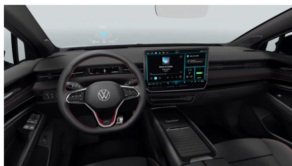
Soul Black - Red (ZQ) Standard from ID.7 GTX PLUS

Note: The print processes do not allow exact reproduction of the upholstery & insert colours.