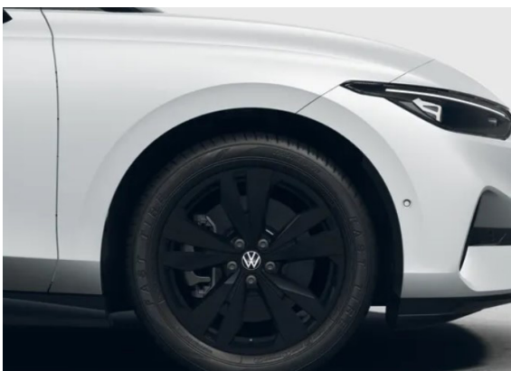
OPTIONAL ON ID.7 PRO PLUS / PRO S PLUS (WBS) 19" "Bergen" alloy wheels 8 J x 19 / 8.5 J x 19, in black