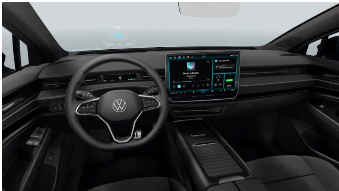
Soul Black (ZN) Standard from ID.7 PRO PLUS / PRO S PLUS