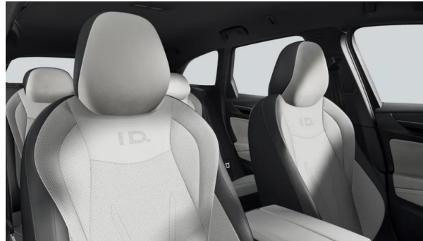
Inserts of front seats and outer rear seats in perforated ArtVelours ECO microfleece, seat bolsters in Artex Mistral / Soul Black (ZP) (forces option package PBF) Optional from ID.7 PRO PLUS / PRO S PLUS